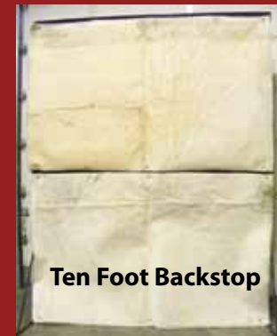
Ten Foot Backstop

MotionTargets also produces our new innovative Arrow Felt™ shooting backstops and stands that will help protect walls and other property by stopping or significantly reducing the velocity of most arrows. May be used in 8' X 10' or 8' X 5' size. (NOT FOR USE WITH FIREARMS EVENTS). Note these backstops will NOT provide complete safety or stop all arrows! A safe backdrop is always required. Motion Targets assumes no responsibility for damage or injury caused by projectiles which are not stopped by the backstop of stand.