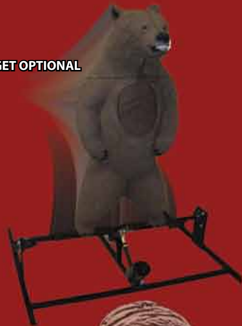
3D TARGET OPTIONAL

Our fully self contained and portable system accepts virtually any 3-D archery target and all Motion Target Gun Hunter™ gun targets. The system may be used inside or out for archery or firearm events and provides maximum shooter enjoyment and profit for you.